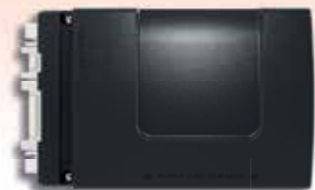
Main unit Camper

Pandora Camper and Camper Pro - telemetric security and service systems for motorhomes built on the most advanced hardware and software platform