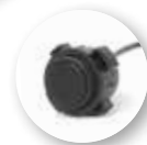
adjustable inner black 16 mm