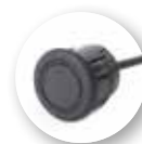
black 18,5 mm