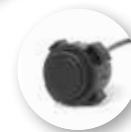
adjustable inner black 16 mm