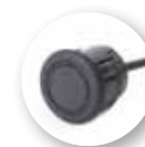
black 18,5 mm