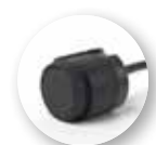
inner black 16 mm