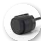
inner black 16 mm