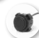
adjustable inner black 16 mm